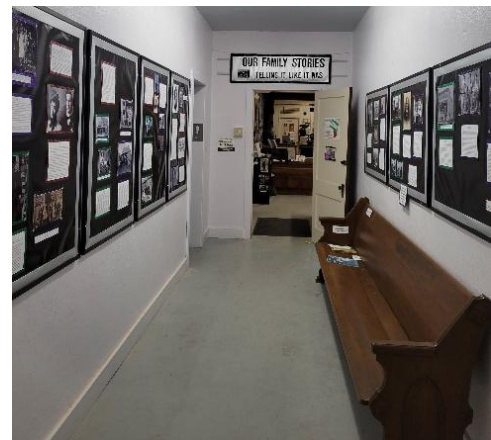
Our Family Stories

Has your family lived here for generations, or did you join us recently? Maybe you just visit as often as you can. What brings you to our beautiful area? What is one of your favorite memories here? We are collecting stories, and we need yours. Not your complete history - just 250-350 words. This is part of the exhibition, Our Family Stories , in the hallway entering the museum. We are celebrating the 50 th year of the museum, and we will publish our collection this year. Don't be left out! For more information, come to the Bellaire Public Library on the third Thursday of any month - anytime from noon to 2 - we'll work together on your ideas. There's a link to submit your writing on our website, or just reach out to us and we'll find a way. We really do want your story!