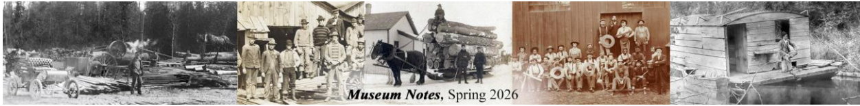
Museum Notes, Spring 2026